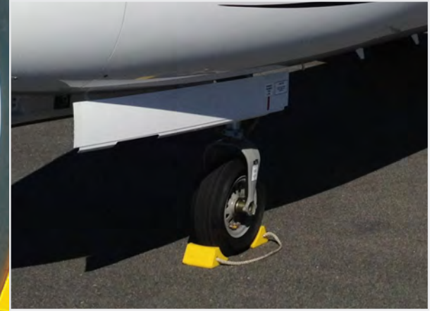
PICTURED: AC3512 IN USE (LEFT) AC201 IN USE (TOP)

Checkers' Monster Wheel Chocks comply with the safety requirements of a variety of industries and ensure a safe working environment while your vehicles are at rest. Offered in a variety of styles, our wheel chocks provide a safe chocking solution for any type of vehicle.