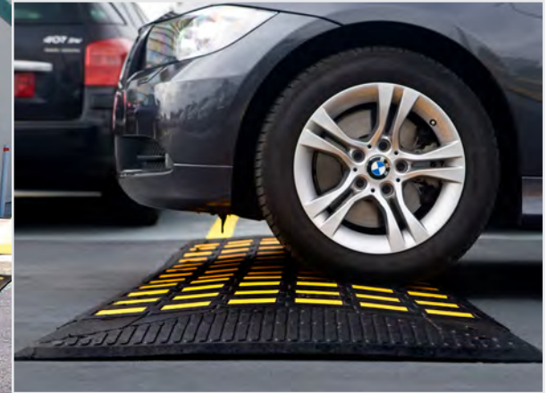
PICTURED: SAFETY RIDER SPEED HUMPS

Monster Motion Safety is a full service manufacturer of parking lot safety solutions. We design and manufacture traffic control products that help cars navigate and park safely. Our main goal has been to create solutions that protect motorists and pedestrians from the perils of today's parking lots. As such, Monster's products have been designed and developed with speed reduction, driver and pedestrian safety in mind. All of our solutions are manufactured from 100% recycled rubber and plastic. Rubber and plastic speed bumps or parking blocks, for example, are longer lasting, highly visible, and more car-friendly than asphalt or concrete alternatives. Not only are Monster's traffic safety solutions environmentally friendly, they can also be installed for both temporary or permanent use.